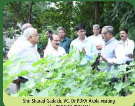
the PROJECT POSHAN