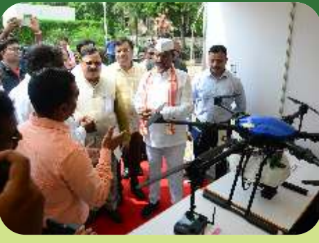
Agri. Minister Shri Abdulji Sattar, visiting the Drone stall