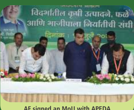
AF signed an MoU with APEDA