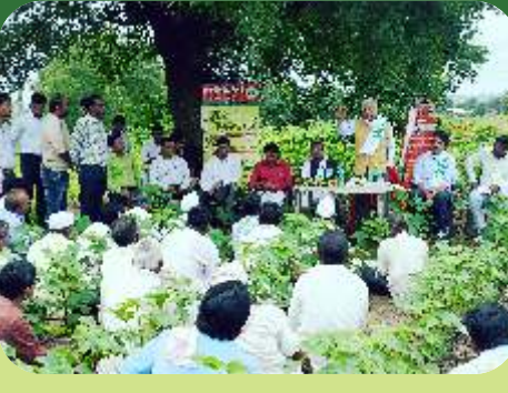
Interacting with farmers about PB knot technology