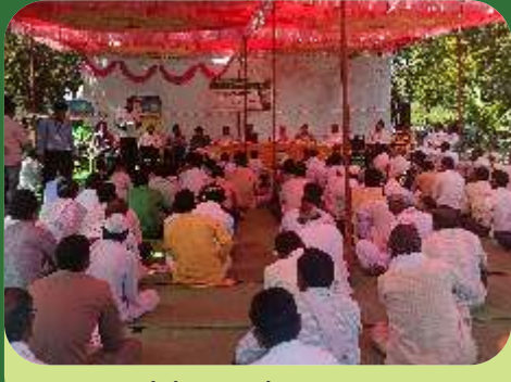
Farmer workshops under PROJECT POSHAN