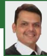
Shri. Devendra Fadanvis Dy. CM, Maharashtra

Agrovision has shown the farmers of Vidarbha applications and benefits of using new technologies and unlocking possibilities to increase their yield. Through well curated workshops and conferences, Agrovision is ensuring the transfer of hands-on knowledge from experts to farmers. I encourage the farmers of this region to adopt and rejuvenate natural farming practices to become self-reliant."