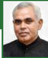
Shri. Acharya Devvrat Governor of Gujarat

"Agrovision is a platform for farmers to realise their dreams of sustainable and prosperous living through the adoption of modern knowledge, technology, information, and machinery. Agrovision is pursuing to facilitate various schemes and projects related to dairy, sugarcane, orange, fisheries, and organic farming. Farmers can not only become producers of grain but also that of energy, aviation fuel & even bitumen. I dream that they will be Urja Daata in addition of being Anna Daata...."