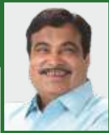
Shri. Nitin Gadkari Chief Patron, Agrovision

The closing ceremony hosted Shri. Devendra Fadanvis , Dy. CM, Maharashtra, along with other esteemed leaders and dignitaries from various states.